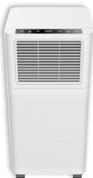
IGLÚ-0723 | IGLÚ-0923