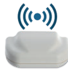
"Smartbox" Sold separately